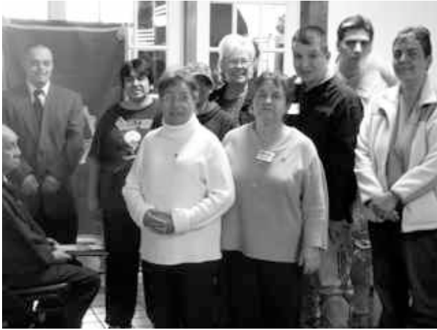
Members of Cornucopia's Civitan Club

Caring for our Community with Care and Respect