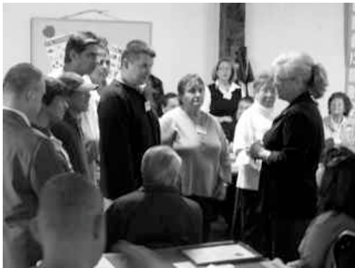
Induction of Cornucopia Civitan Officers

Members of Cornucopia's Civitan Club have been focusing the meetings on the importance of service to others, a primary aspect of Civitan's guiding principles. Club members have been involved in making gifts for people residing in nursing homes, as well as for children in shelters. In addition to these efforts to assist others, club members have been enjoying sing-alongs and karaoke, where a lot of previously unrecognized musical talent has been